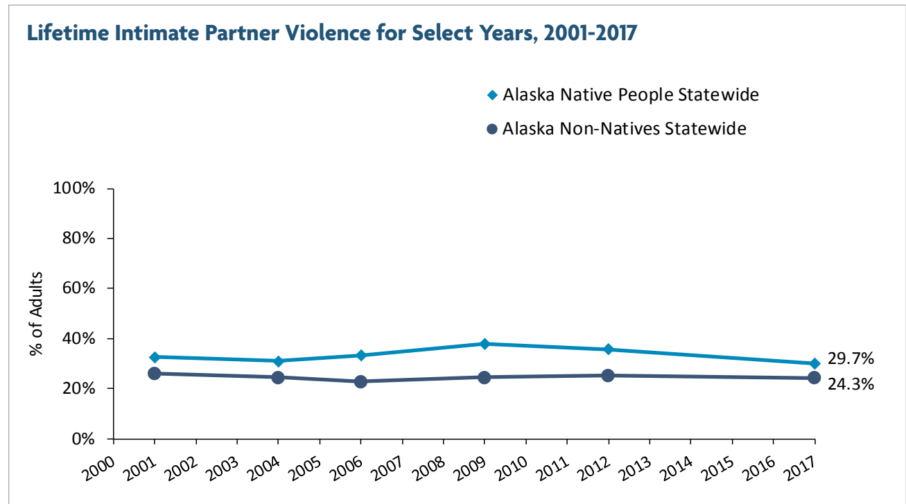
Data Source: Alaska Division of Public Health, Behavioral Risk Factor Surveillance System Appendix Table C-118